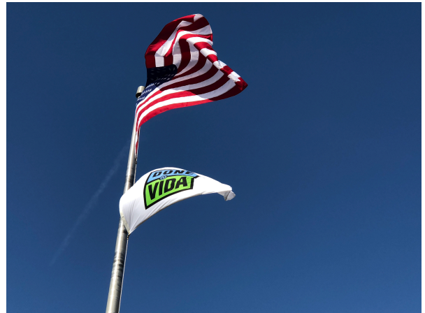
Donate Life Flag-Raising Dublin Methodist Hospital