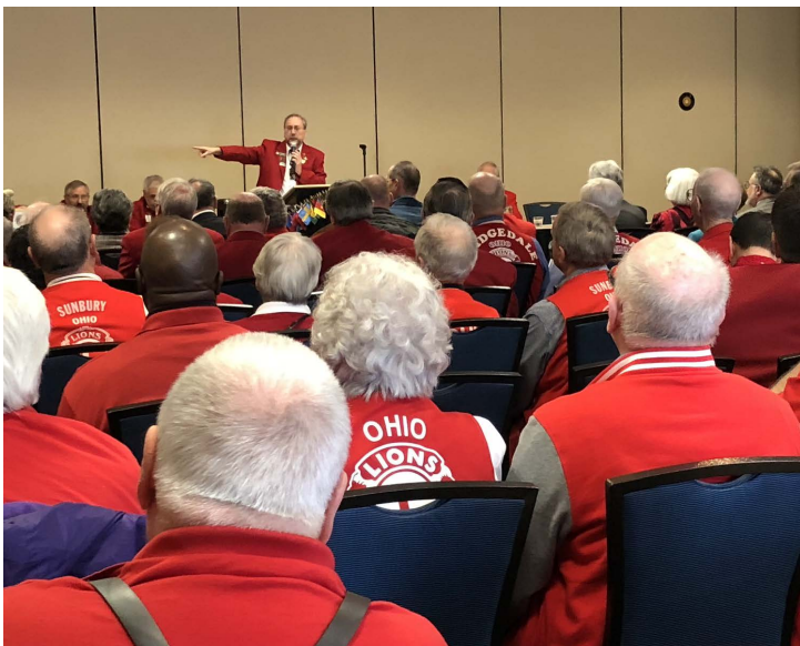
OH5, OH6, OH7 District Conventions